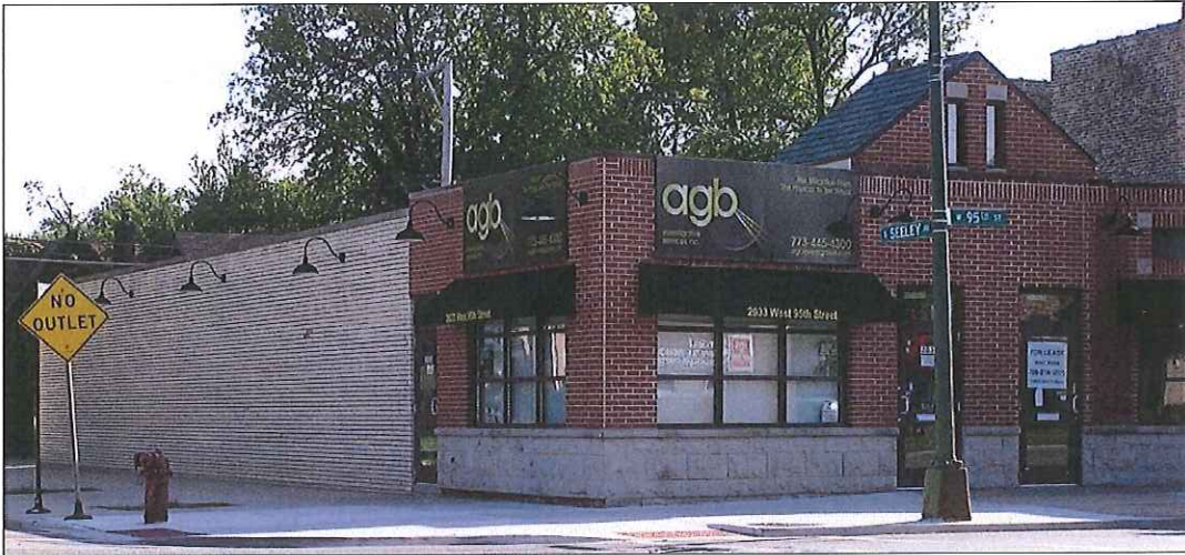
AGB Investigative Services, Inc. Headquarters 2033 West 95th Street Chicago, IL 60643